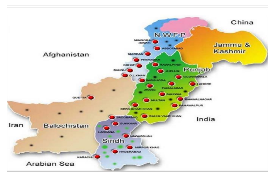
Figure 2. Hospitalization coefficient per 100 thousand inhabitants for essential arterial hypertension by health region in Punjab, Pakistan, in 2023.

Recent research has shown that essential hypertension is a complex and multifactorial condition influenced by a combination of genetic and environmental factors. Furthermore, adequate control of arterial hypertension is essential to prevent severe cardiovascular complications, such as stroke, heart disease and coronary artery disease. Therefore, public health policies and health services in each health region must be able to identify and treat individuals with essential hypertension to reduce morbidity and mortality due to this condition (Gutenschwager et al., 2024).