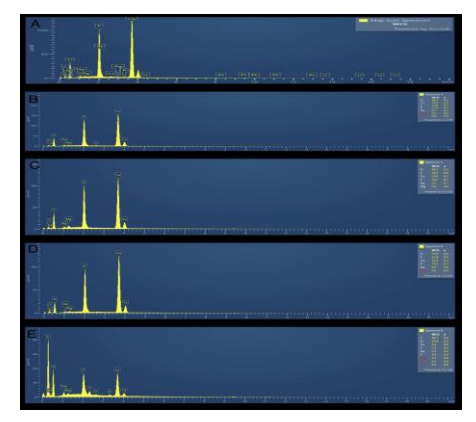
FIG 2: Electron dispersal spectroscopy images with peaks of ions predominantly present.(a-e)