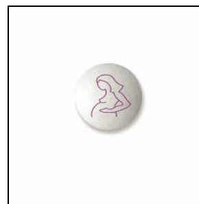
FIG. 4 Example of indicia used on a tablet to encourage women to use the product in pregnancy

While these findings must await more studies in pregnant women, this may be an important means to increase compliance and hence effectiveness of medications in pregnancy, with a parallel decrease in morbidity and need for hospitalization.